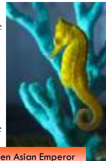
Golden Asian Emperor

A native to South east Asia, this large and hardy species is an excellent choice for new hobbyists. Colours vary from black with intricate white striations to orange or yellow with red spots and individuals may change colour overnight.